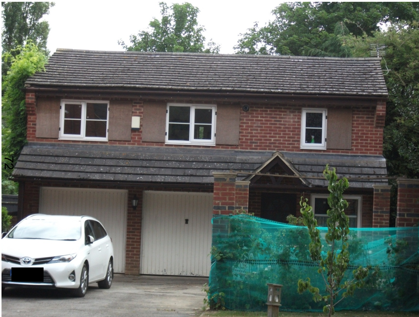
Garage for ancillary accommodation