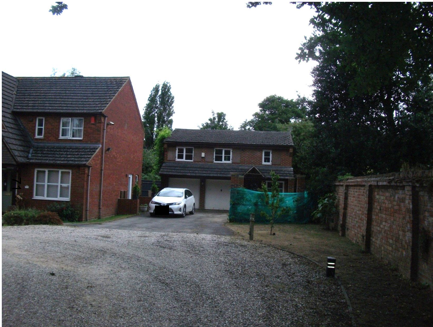
3 David Nicholls Close and Garage